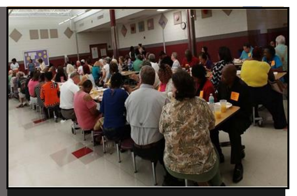
Parents receiving valuable information at a school's parent night

Additionally, the Federal Programs department will provide training to principals so principals will understand parent and family engagement requirements and plan opportunities for family engagement activities and meetings for the remainder of the school year.